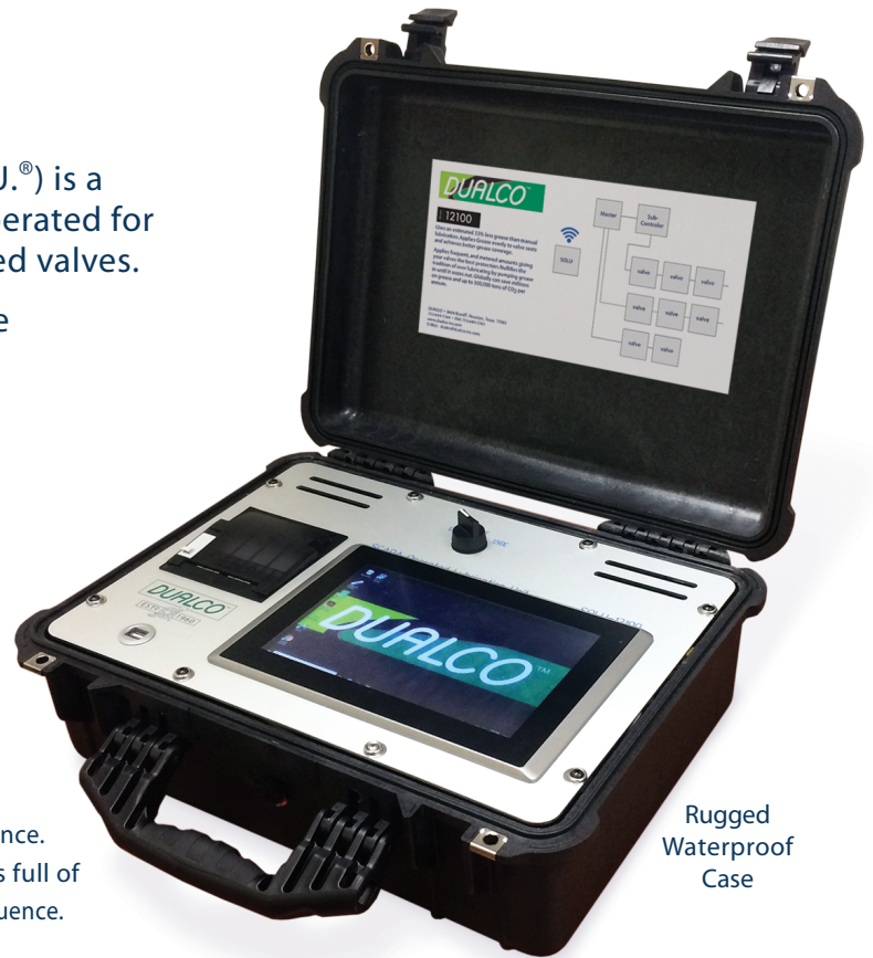
Rugged Waterproof Case